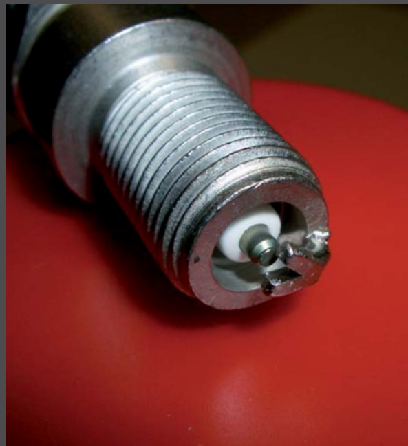
SplitFire - Standard V- electrode

SplitFire – Standard V-electrode SplitFire – Triple Platinum